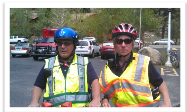
Emergency Medical Services Staff working at Bike to Work Day in June