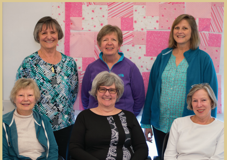
The Trail Ridge Quilters' "Paint Estes Pink" quilt.